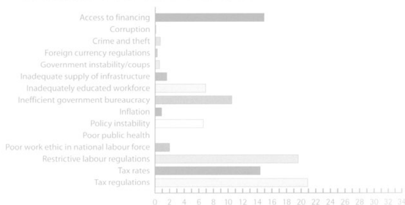
The most problematic factors for doing business

jurisdictions, in a secondary buy-out of the group by Blackstone.